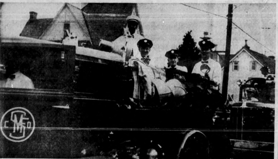
ACCLAIMED — Volunteer firemen turned out in large numbers Saturday at festivities marking the opening of Bethlehem Pike. The coming Saturday, many of them will go to Atlantic City for a mammoth state-