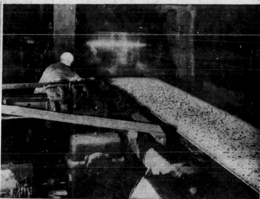
END OF 47-YEAR-OLD STEEL ROLLING MILL — A worker at Alan Wood Steel Co. is shown hand gauging the last plate produced on a steel rolling mill which has been in continuous operation since 1914. The old mill was closed down preparatory to placing the company's new 110-in. rolling mill into operation. More than 4½ million tons of plate were rolled on the old