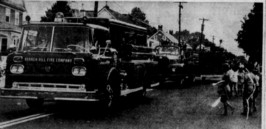
EYE OPENER — Many residents who have had no opportunity to watch growth of volunteer fire-fighting units in recent years were pleasantly surprised Saturday in Flourtown. Here are apparatus entered by Bar-