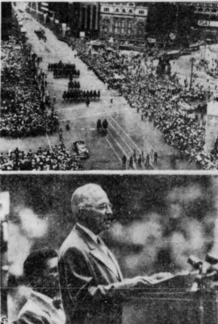
CELEBRATING DETROIT'S 250th BIRTHDAY, part of the giant parade held to commemorate the event passes the reviewing stand (top) while cheering thousands line the streets...